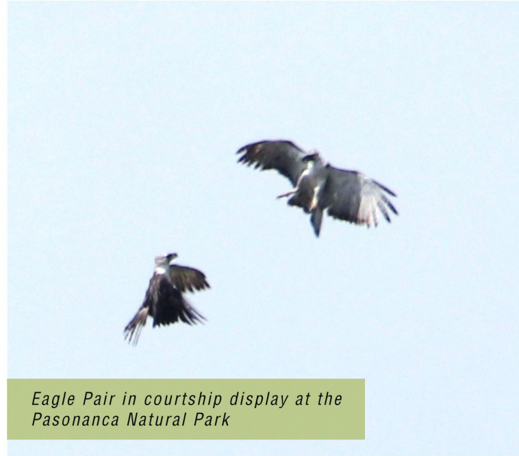
Eagle Pair in courtship display at the Pasonanca Natural Park

This project is supported by USAID Protect Wildlife Project, Zamboanga City Government, Zamboanga City Water District, and DENR IX.