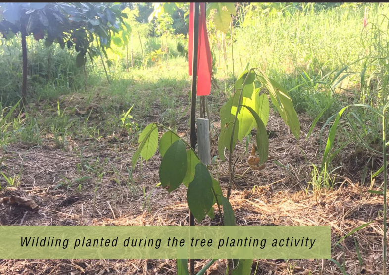
Wildling planted during the tree planting activity

Stella Maris Academy of Davao (SMAD) Batch 1995 sponsored the planting of 700 native wildlings at the ALI Carbon Forest in Bago Gallera, Davao City. Their initiative was launched on June 10 through a live stream of the tree planting activity on the PEF’s Facebook Page as part of the Philippine Eagle Week celebration. Netizens were able to watch the wildlings being planted by the PEF staff and partner forest guards.