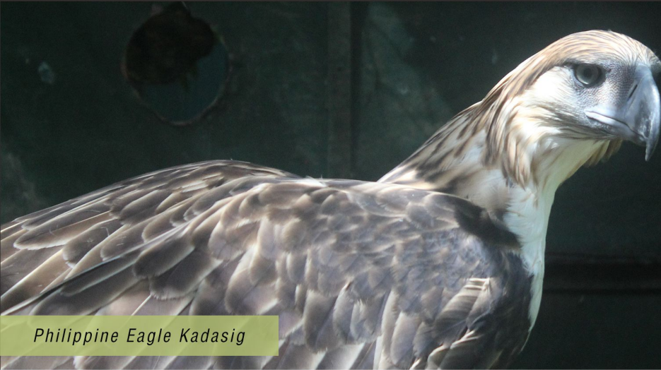
Philippine Eagle Kadasig