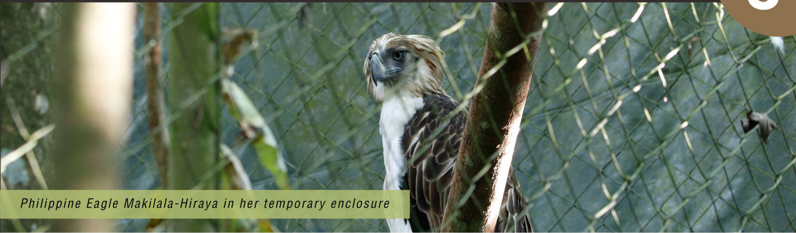
Philippine Eagle Makilala-Hiraya in her temporary enclosure